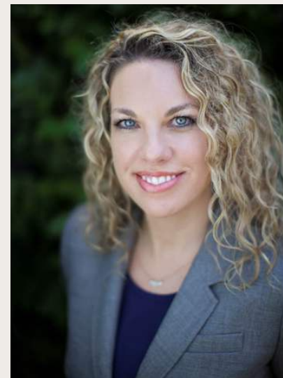
Dr. Daniel J. Siegel & Dr. Tina Payne Bryson