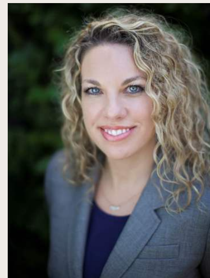
Dr. Daniel J. Siegel & Dr. Tina Payne Bryson