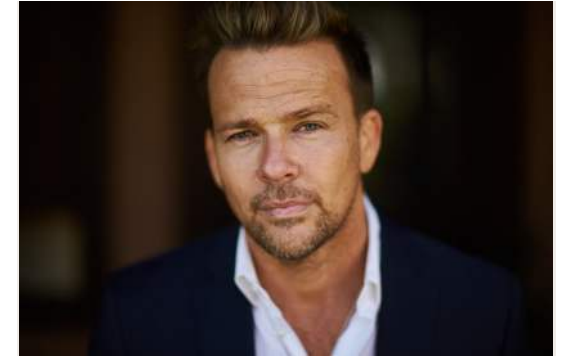
Sean Patrick Flanery