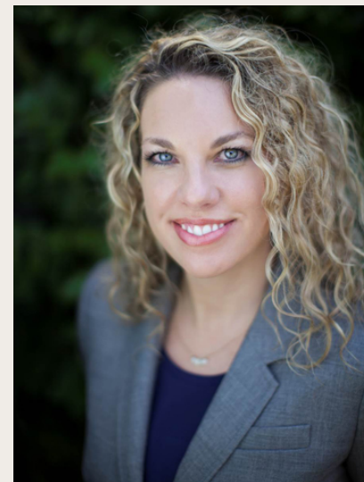
Dr. Daniel J. Siegel & Dr. Tina Payne Bryson